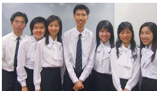
科大合唱團校友會於本年十一月十日為科大校友會周年晚會獻唱

在不久的將來，本會一定會繼續為校友們，提供更多更好的活動，務求令每位校友都能繼續盡展所長，唱好科大！