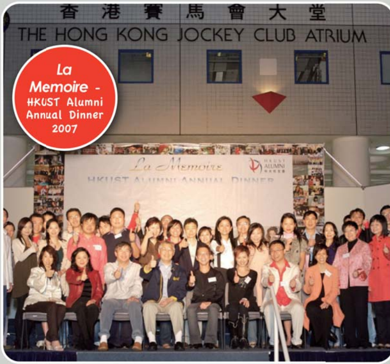
Uplifting ambience surrounds the Atrium at the HKUSTAA Annual Dinner on November 10, 2007

The HKUST Alumni Association organises monthly Get-Together, with a different theme every month, to link you up to fellow alumni and guests from different industries, careers, interests and seniorities. Visit http://www.ustaa.hk to learn more about how you can ride on this expanding network of excellent people.