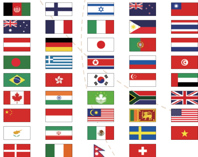
Places where alumni are based

UST’s alumni network is also rapidly growing and currently has more than 30,000 members residing in some 44 countries / places around the world. UST alumni are almost everywhere from Shenzhen, China to Silicon Valley in the States. Although they are geographically apart, they have maintained close ties to their Alma Mater.